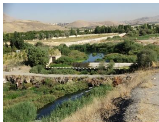
Figure 2: Station 2 before the refinery adjacent to the airport.

possible to sample benthic and fish due to the type of substrate and the difficult path, as well as the high pollution. This issue was agreed upon in coordination with the project supervisor.