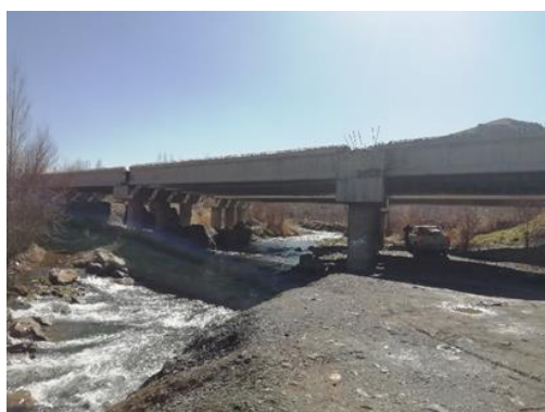
Figure 1: Station 1 with gravel and sand bed.

Figure 1 shows Station 1 with a gravel and sand bed, this station is located before the city of Sanandaj. It has clear and relatively clean water. The water depth is about 70 cm with a relatively strong current. On the banks of the river, scattered gardens and agricultural activities take place. The riverbed is relatively natural and has the least impact of human activities compared to other stations.