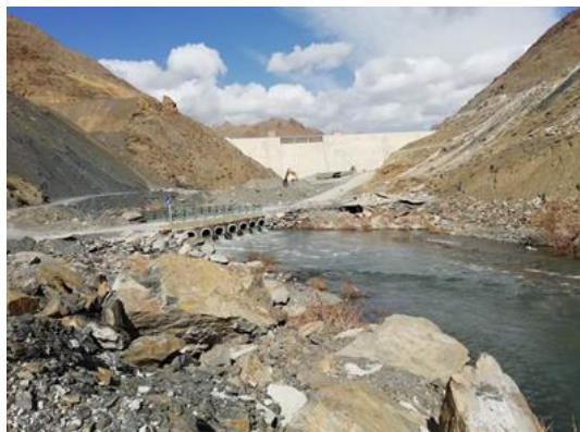
Figure 6: Station 6 with rocky and rubble bed (after dam crest structure.)

with formalin to a final volume of 0.5-2%. Immediately after transferring the samples to the glass bottle, a label with the relevant information (station name and sampling time) was attached to each sample based on predetermined codes.