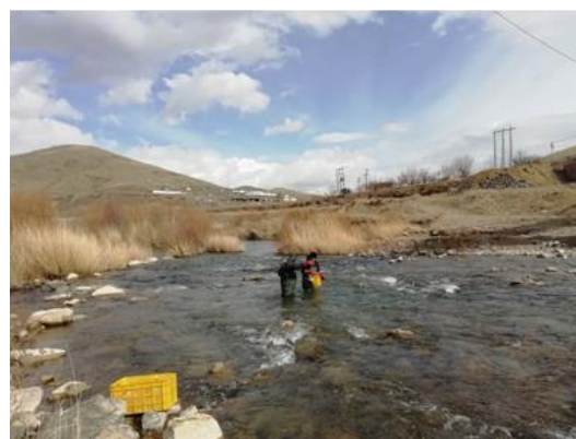
Figure 5: Station 5 with rubble bed.

Gaveh River and is less disturbed. About 10 kilometers downstream from this station, this branch merges with the Qeshlaq branch and forms the main branch of Sirvan. The riverside vegetation at this station is more than all other stations, and the water depth is more than 80 cm with a relatively high velocity. The water is relatively clear, and there are scattered gardens and agricultural activities along the riverbank.