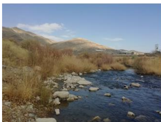
Figure 4: Station 4 with mud bed combined with rocks.

Figure 4 shows station 4 with a mud bed combined with rocks, about 3 km away from station 2. There are scattered gardens and agricultural activities along the riverbank. The water depth is more than 1.20 meters with a relatively strong water velocity. Although the pollution and turbidity of the water at this station is less than at Station 1, it is still high and contaminated with various types of sewage.