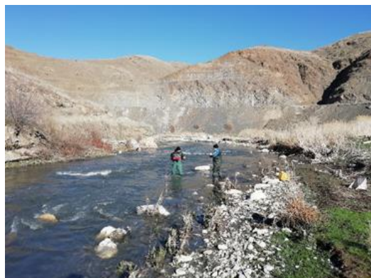
Figure 3: Station 3 with gravel bed after the refinery.

industrial, urban, and domestic wastewater enter the river.