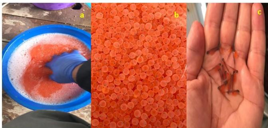
Figure 3: Egg and marsupial hatchling with prominent eyes, a, b, c (Original, 2024).